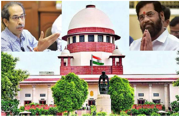
Now the Election Commission will decide who carries the real Shiv Sena tag, Uddhav Thackeray or Eknath Shinde.

However, the bench comprising Justices DY Chandrachud, MR Shah, Krishna Murari, Hima Kohli, and PS Narasimha allowed the ECI to decide a